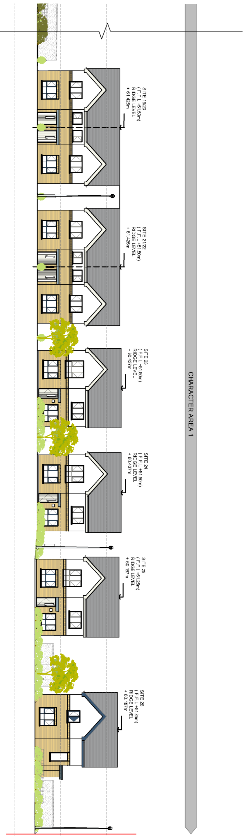
ELEVATION 11 | LOOKING NORTH - PART 2 OF 2