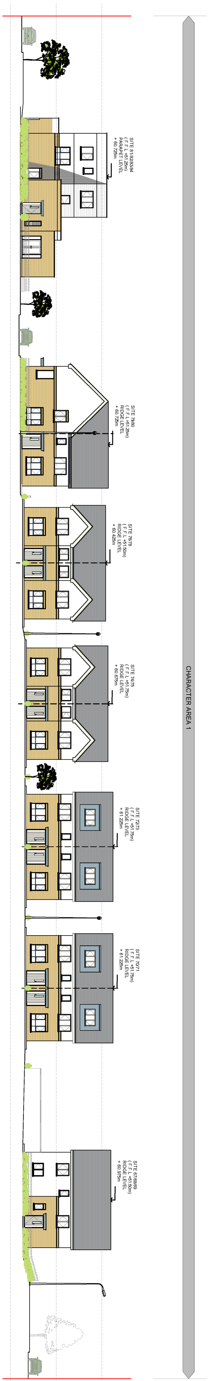
ELEVATION 21 | LOOKING SOUTH