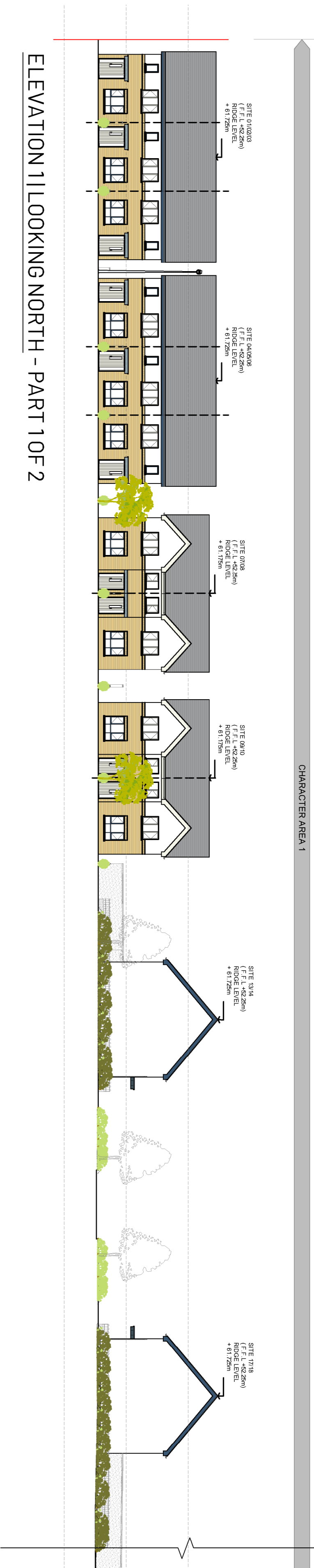
ELEVATION 11 | LOOKING NORTH - PART 1 OF 2

Figured dimensions only are to be used. All dimensions to be checked on site. Differences between drawings and between drawings and specification or bills of quantities to be reported to Engenuiti Consulting Engineers © The copyright of the drawings and designs contained therein remains vested in the Duplan Limited via Engenuiti Consulting Engineers