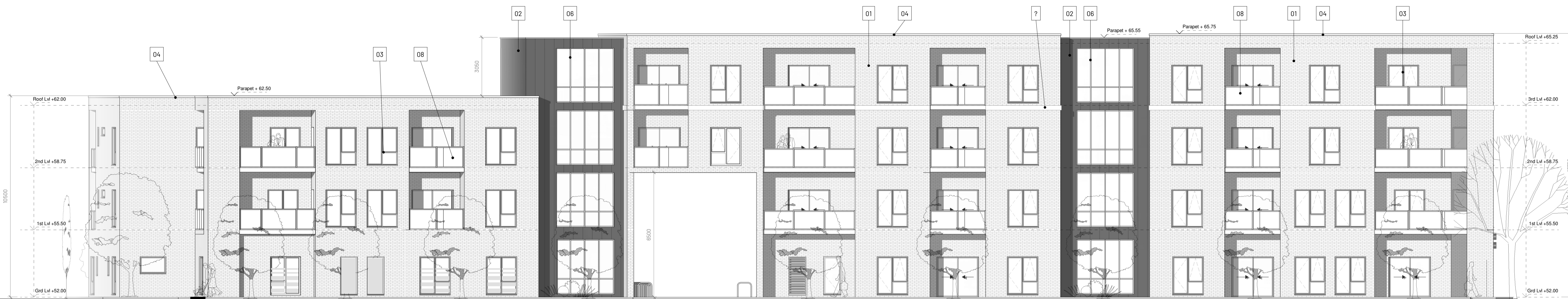
1 EAST ELEVATION 1 : 100

THESE DRAWINGS, PLANS AND SPECIFICATIONS AND THE COPYRIGHT THEREIN ARE THE PROPERTY OF THE DESIGNER AND MUST NOT BE USED, REPRODUCED OR COPIED WHOLLY OR IN PART WITHOUT THE WRITTEN PERMISSION OF THE AUTHOR. ALL RIGHTS RESERVED.