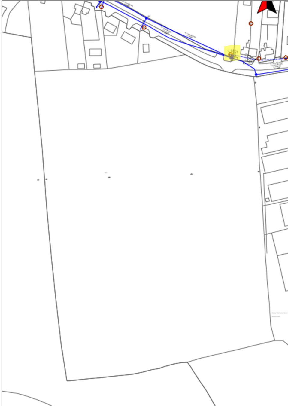
Figure 3 – Eir network junction location.

The proposed site is located within the fibre coverage area. There is an Eir cabinet located opposite to the main access junction and it is planned to connect the site from this location.